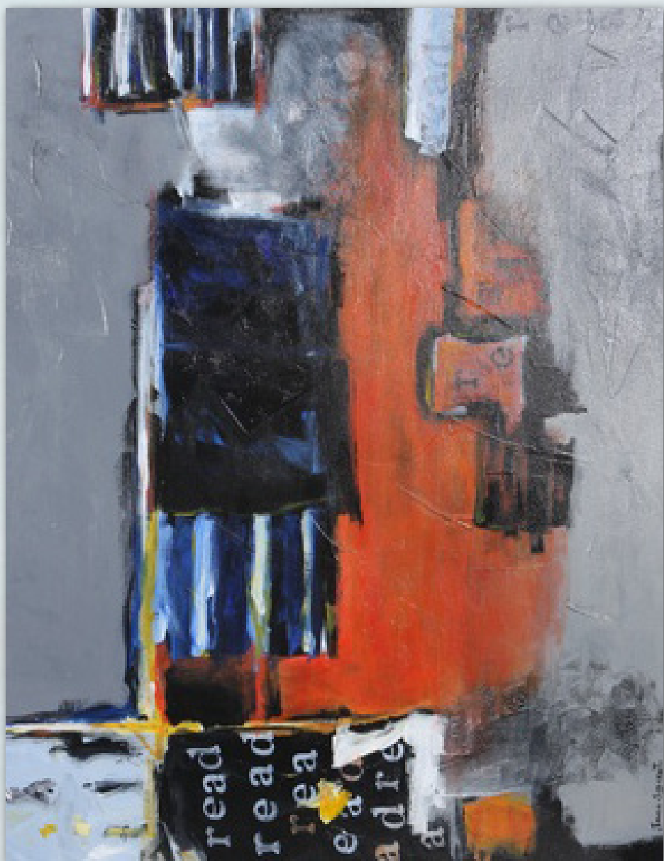
Jane Segrest, "Note Series: Read" 30x24 acrylic on canvas