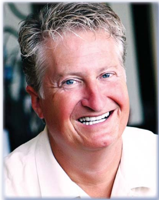
ANDY ANDREWS NY TIMES BEST SELLING AUTHOR